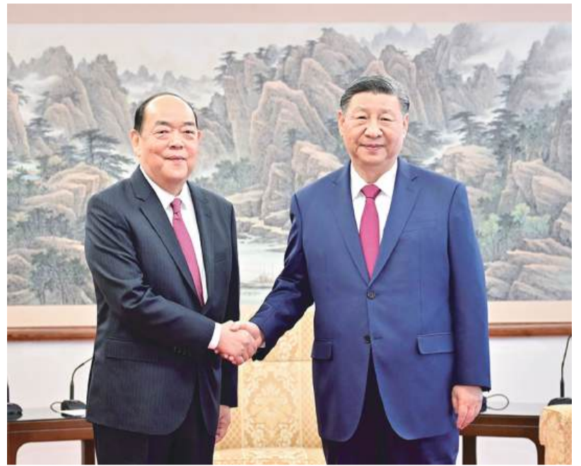
This file photo taken by Xinhua shows president Xi Jinping (right) shaking hands with Macau's then chief executive Ho Iat Seng during a meeting at the San Chok Un ("New Bamboo Mansion") Guesthouse on Penha Hill on Wednesday.

Meanwhile, under another executive order announced and put into effect yesterday, the previous government's secretary for Economy and Finance, Lei Wai Nong, has been appointed as a full-time member of the Executive Committee of the public Macao Foundation (FM) for a term of one year. ■