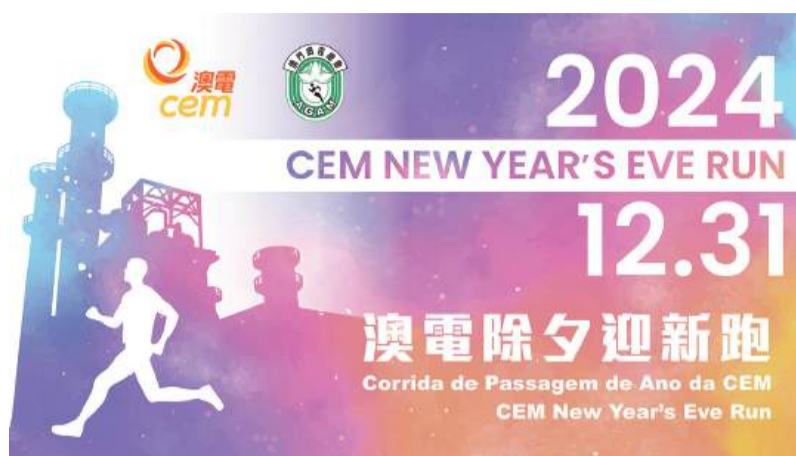
This poster provided by power utility CEM promotes the upcoming "2024 Fourth Round of the Long-Distance Running League: CEM New Year's Eve Run".

The upcoming event celebrates the 75 th Anniversary of the Founding of the People's Republic of China (PRC), the 25 th Anniversary of