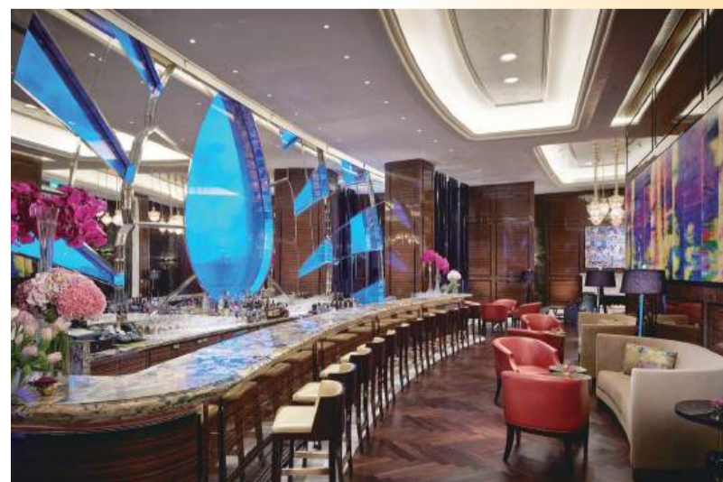
This undated handout photo shows The Ritz-Carlton Bar & Lounge in Cotai.

Reservations and enquiries can be made by calling 8886 6868.