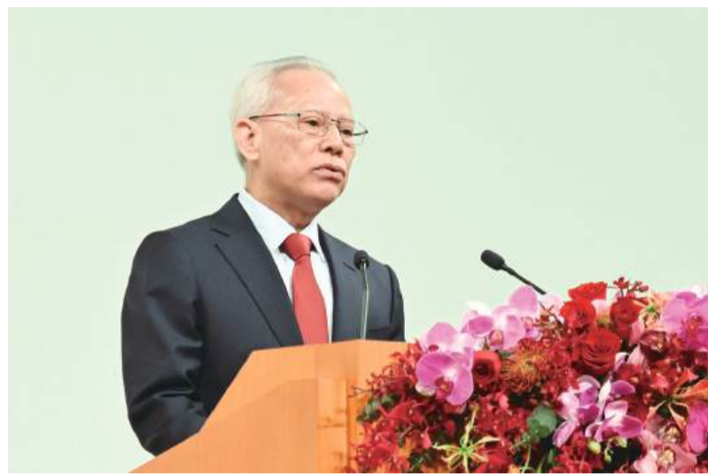
Newly sworn in Chief Executive Sam Hou Fai delivers his inauguration speech during yesterday's gathering celebrating the 25 th Anniversary of Macau's return to the motherland and inauguration ceremony of the Macau Special Administrative Region's (MSAR) sixth-term government at the Macau East Asian Games Dome in Cotai.

Firstly , Sam said, the government will strive to enhance capabilities in public administration and governance. With its people-