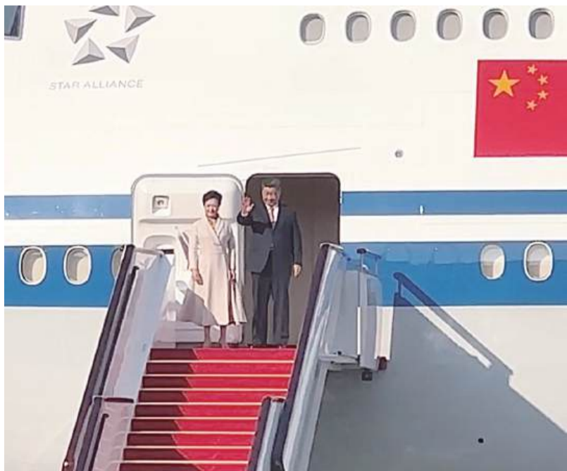
Xi Jinping (right) and his spouse Peng Liyuan stand at the top of their aircraft's steps, while Xi waves goodbye to local students.