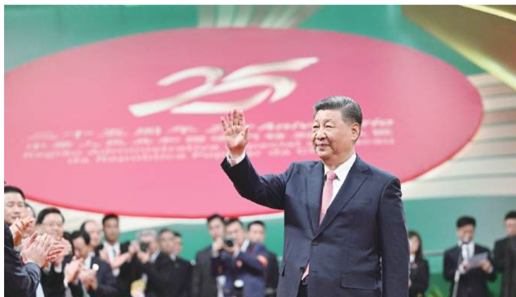
President Xi Jinping, also general secretary of the Communist Party of China Central Committee and chairman of the Central Military Commission, waves to the participants at a meeting celebrating the 25 th anniversary of Macau's return to the motherland and the inaugural ceremony of the sixth-term government of the Macau Special Administrative Region (SAR), at the Macau East Asian Games Dome in Cotai yesterday morning. Xi on Friday delivered a speech at the double event.