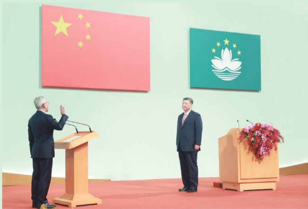
President Xi Jinping (right), also general secretary of the Communist Party of China (CPC) Central Committee and chairman of the Central Military Commission (CMC), administers the oath of office to Sam Hou Fai, new chief executive of the Macau Special Administrative Region (SAR), at the Macau East Asian Games Dome in Cotai yesterday.

Sam Hou Fai was sworn in on Friday as the sixth-term chief executive of the Macau Special Administrative Region (MSAR).