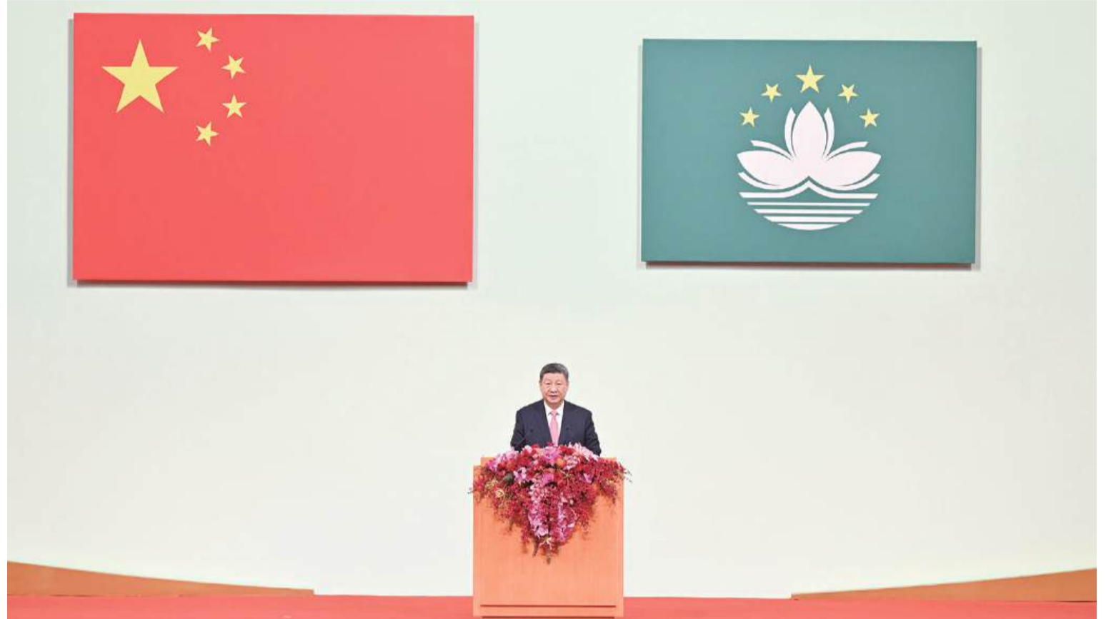
President Xi Jinping, also general secretary of the Communist Party of China (CPC) Central Committee and chairman of the Central Military Commission (CMC), delivers a speech at a meeting celebrating the 25 th Anniversary of Macao's return to the motherland and the inaugural ceremony of the sixth-term government of the Macao Special Administrative Region (MSAR), at the Macao East Asian Games Dome in Cotai yesterday morning.

– Economic and social development has seen a historic leap, and residents enjoy a much stronger sense of gain, happiness and