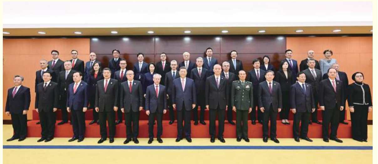
President Xi Jinping (center, front), accompanied by senior officials from the central authorities, poses with new and reappointed officials of the executive, legislative and judicial organs of the Macau Special Administrative Region (MSAR), including members of the advisory Executive Council, on the last of his three-day inspection visit to Macau yesterday.

Cai Qi, Xia Baolong and other senior officials attended the meeting. Chief Executive Sam Hou Fai was also present.