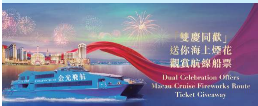
This image promotes the ticket giveaway for the Macau Cruise Fireworks Route.

More information is available on www.cotaiwaterjet.com and www.facebook.com/cotaijetferry , while one can also call 2885 0595.