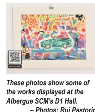
These photos show some of the works displayed at the Albergue SCM's D1 Hall.