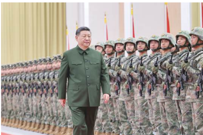
President Xi Jinping, also general secretary of the Communist Party of China (CPC) Central Committee and chairman of the Central Military Commission (CMC), reviews the troops during his inspection of the Chinese People's Liberation Army (PLA) garrison stationed in the Macau Special Administrative Region (MSAR), yesterday.

Yesterday's ceremony was also attended by senior officials including Cai Qi, as well as Edmund Ho Hau Wah, vice chairman of the National Committee of the Chinese People's Political Consultative Conference (CPPCC), HKSAR Chief Executive John Lee Ka-chiu, and former Macau SAR chief executives Fernando Chui Sai On and Ho Iat Seng. — Xinhua, MPD