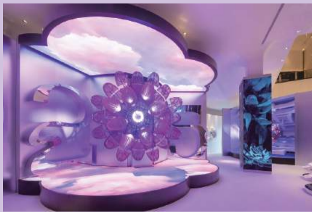
This undated handout photo provided by Melco Resorts & Entertainment earlier this week shows the "Blooming Dialogue" Zone at City of Dreams (COD) in Cotai.

The installations were created "with precision by cutting-edge technology, meticulously engineered and designed with innovative lighting and projection that uncover