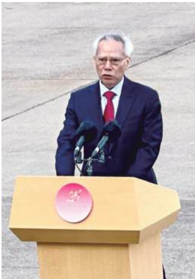
Chief Executive Sam Hou Fai delivers a speech upon President Xi Jinping's departure at the local airport yesterday.

of unity and collaboration, noting that the government functions as an organic entity. Thus, handling affairs should not be limited to a single public entity, Sam said, pledging to enhance regular communication with patriotic and Macau-loving organisations, fostering a strong synergy for governance according to the law.