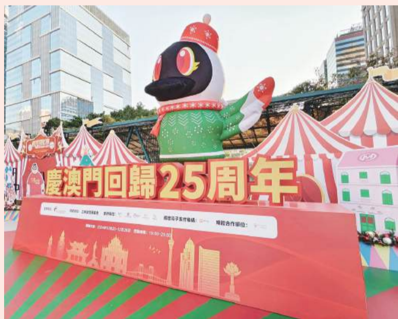
This photo provided by the Federal General Commercial Association of Macau Small and Medium Enterprises shows its ongoing "Colourful Carnival Celebrating the 25 th Anniversary of Macau's Return" in Praça da Amizade (友誼廣場) yesterday.