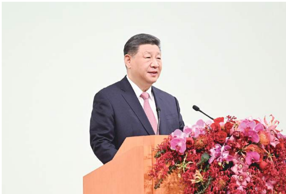
President Xi Jinping delivers a speech at a meeting celebrating the 25 th Anniversary of Macao's return to the motherland and the inaugural ceremony of the sixth-term government of the Macao Special Administrative Region (MSAR), at the Macao East Asian Games Dome in Cotai yesterday morning.

First, Macao should endeavor to promote appropriate economic diversification. It should fully leverage its distinctive strengths and resource endowment, be clear about its role, focus on key sectors, improve development planning for relevant industries, and step up policy and funding support so as to cultivate internationally competitive new sectors. Efforts should be made to achieve greater economic synergy, more harmonized rules, and more efficient and convenient cross-boundary flow of various factors between Macao and the Guangdong-Macao In-Depth Cooperation Zone in Hengqin. Macao should focus on key areas, promote scaled development of its distinctive sectors, and launch landmark projects and programs that will have knock-on effects on other sectors. It should be noted that the Central Authorities' decision to develop Hengqin is aimed at promoting appropriate economic diversification in Macao and facilitating the life and work of Macao residents. This should be kept in mind, and sectors and projects that are not in line with this purpose should not be developed. Macao should more actively take part in the development of the Guangdong-Hong Kong-Macao Greater Bay Area, pool quality resources and deepen coordinated development. It is also important for Macao to advance integrated development of education, technology and talent and do more